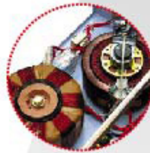
SVC-5000VA SVC-7500VA SVC-10KVA