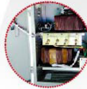
SVC-10KVA (vertical type)