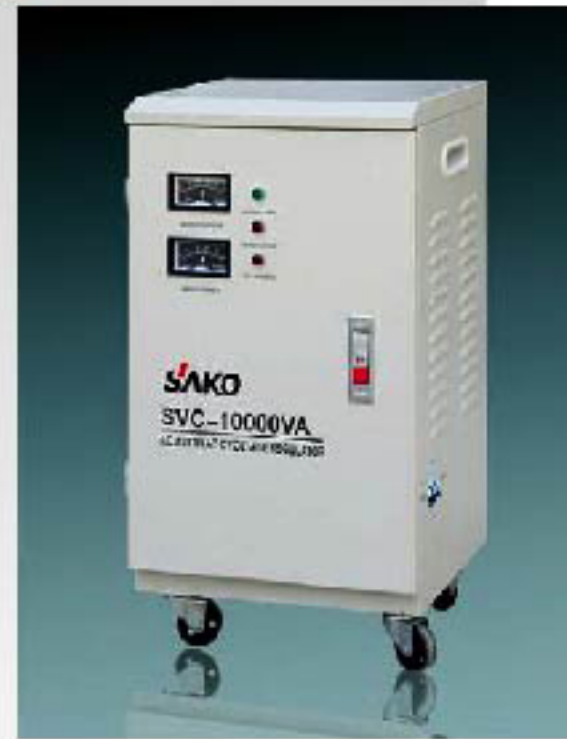
SVC-10KVA (vertical type)